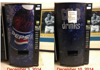
December 3, 2014